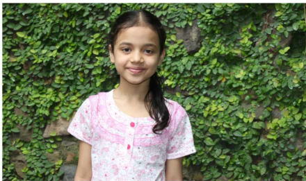
ISLAMABAD, RAWALPINDI & OUR THRIVING BENEFICIARIES

"WHOEVER PAYS THE ZAKAT ON HIS WEALTH WILL HAVE ITS EVIL REMOVED FROM HIM" (IBN KHUZAIMAH AND AT-TABARANI)..